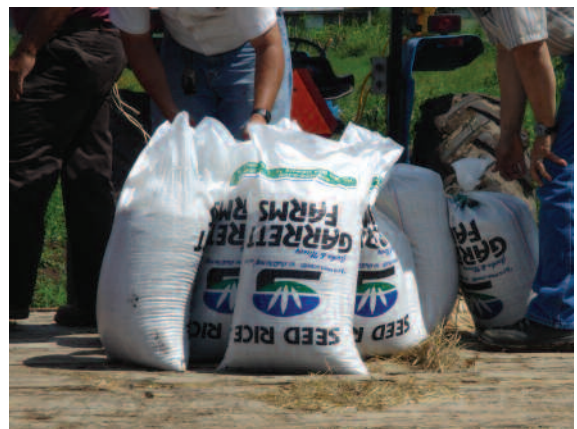
Foundation Seed harvested in the Puerto Rico winter nursery was shipped to Garrett Farms in Texas for planting this spring.

Promising new CLEARFIELD rice varieties are making their way through our product-development pipeline and you will hear about them in future editions of this newsletter.